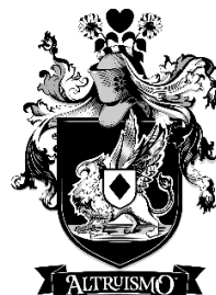
The black house of GIVERS

The House system is used for many things at NCA from rewarding good behavior to fostering a family feel to adding fun. Each student will be inducted into a house on his first day of school and will be a member of that house for his duration at NCA. Students will be able to earn points for their house in a variety of ways on a daily basis.